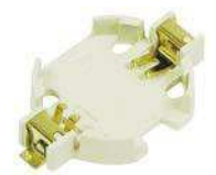
BU2032SM-HD-G high retention