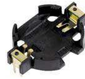
BU2032-1-HD-G high retention