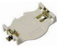
BHSD-2032-SM low profile