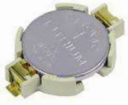
BU2032SM-JJ-GTR high retention