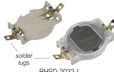
BHSD-2032-L SnapDragon-L patented