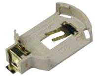
LP2032SM-JJ-GTR low profile