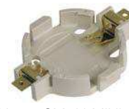
BU2032SM-JJ-MINI-GTR recessed into pcb