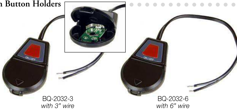
BQ-2032-3 with 3" wire