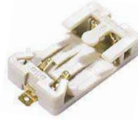
BA2032SM press to eject