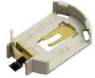
BLP2032SM-GTR low profile