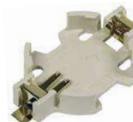
BU2450SM-JJ-G Diameter: 24 mm