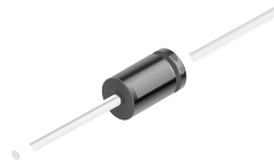
DO-41 Glass case COLOR BAND DENOTES CATHODE